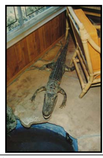
Note: This work may be used and distributed only if it is copied entirely, it is not modified, and it is distributed free of charge. Tucson Tabernacle, 2555 N Stone Ave, Tucson, Arizona 85705 USA