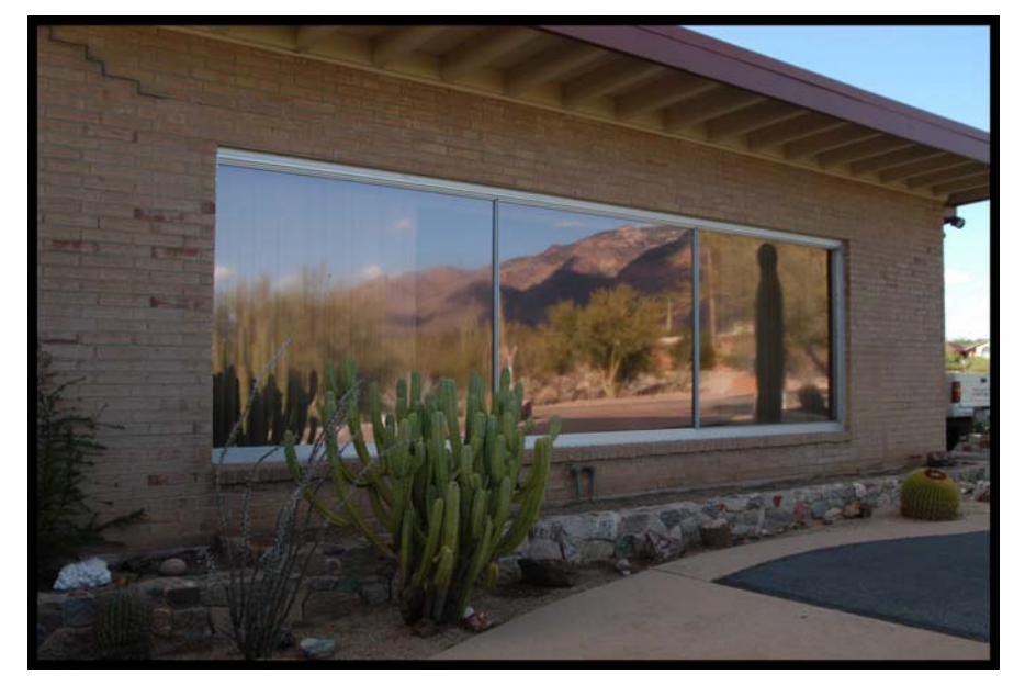
The photo to the left is the den.